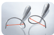
Diameter: 5 - 7 cm

Several reusable instruments are available separately to assist the positioning of DynaMesh®-SIS direct implants: